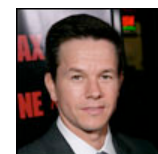
'Max Payne' premiere